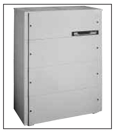
FIGURE 3.2 - Modular Rack With Panels