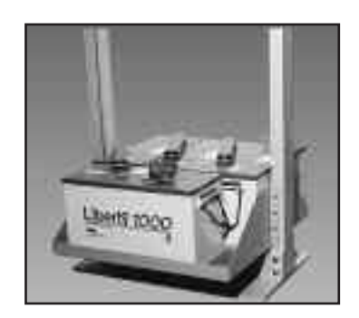
FIGURE 3.3 - Relay Rack Trays