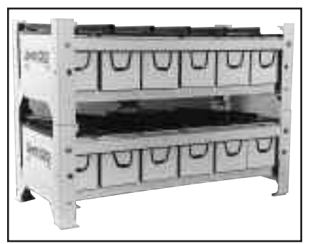
FIGURE 3.1 - Modular Rack Assembly

Note: Optional steel jackets are recommended if the batteries are expected to experience frequent periods of operation at temperatures in excess of 90°F (33°C).